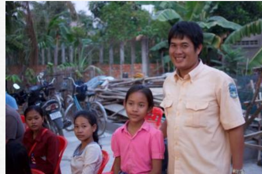
Recruiting volunteers, development plan and financing for the Cours avec Moi! project