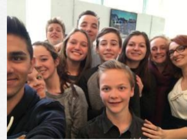
A teaching and solidarity partnership with the Marq Institution junior high school which gave birth to the CambodiAroonii collective!