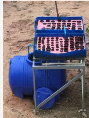
Financing of the Roots educational farm's aquaponic system